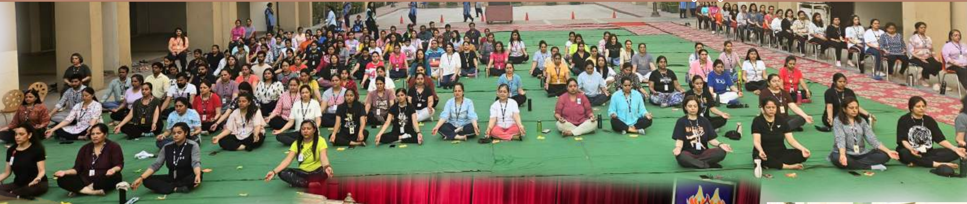
A Joyful Haven for Educators

"All work and no play makes Jack a dull boy!" Echoing this thought, GDGPS Sec 48 nurtures a creatively happy workspace where professional growth meets personal well-being. Beyond skill-building workshops, the school hosted CONNECT, a heartfelt celebration where staff and their families come together expressing gratitude while bonding over fun and cultural exchanges. To foster well-being, the ESTP Retreat promoted mindfulness through yoga, meditation, and invigorating sports. These experiences strengthened bonds, de-stressed, and instilled gratitude, making the school not just a workplace but a thriving, joyful community.