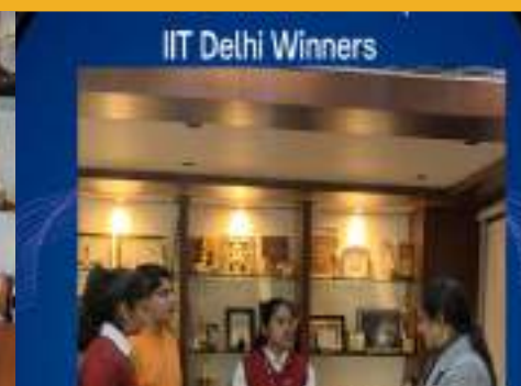
Grade IX & XI students participated in the YOUNG CEO Program Organised by IIT DELHI