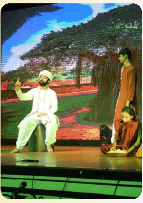
HIGHER | STRONGER | BRIGHTER